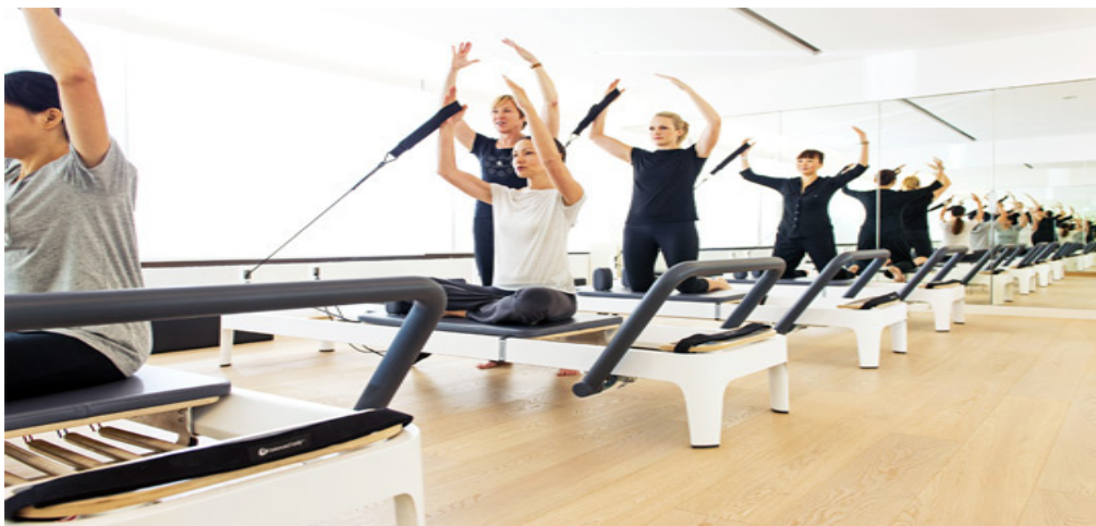
COMO Shambhala Urban Escape